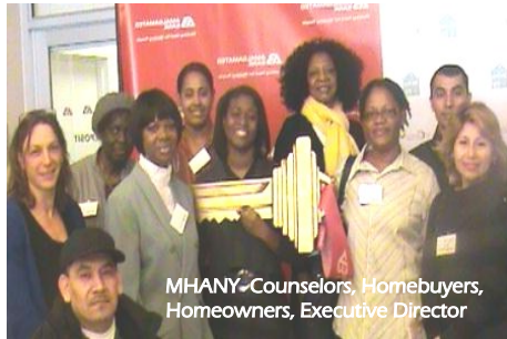
MHANY-Counselors, Homebuyers, Homeowners, Executive Director

Founded in 1986, MHANY Management Inc. is a non-profit 501(c)3 organization that focuses primarily on meeting the needs of low and moderate income residents of New York through intensive housing counseling programs and innovative affordable rental housing development initiatives. Our mission is fourfold: