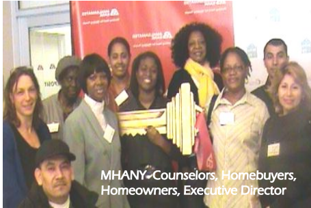
MHANY-Counselors, Homebuyers, Homeowners, Executive Director

Founded in 1986, MHANY Management Inc. is a non-profit 501(c)3 organization that focuses primarily on meeting the needs of low and moderate income residents of New York through intensive housing counseling programs and innovative affordable rental housing development initiatives. Our mission is fourfold: